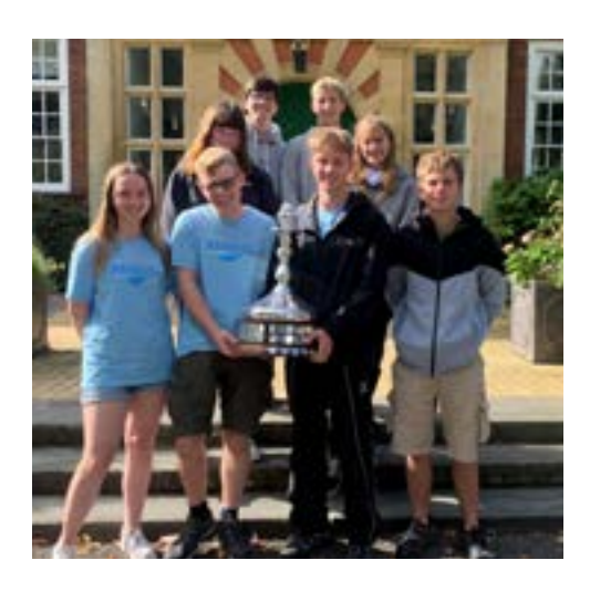
Jolie Brise has once again scooped first place in the ASTO Small Ships Race, winning the magnificent Aurora Cup. In challenging weather conditions, she was first to cross the line in the day-long race across the Solent. Congratulations to the crew members on their fine achievement.