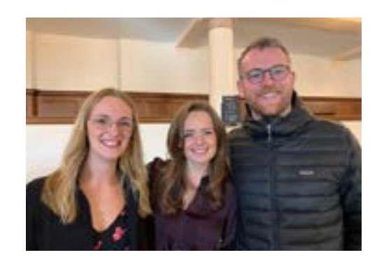
OD Events Class of 2011 Reunion