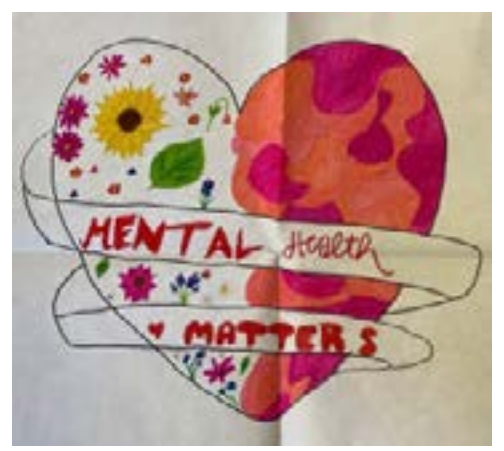
The results are in and MIND is Dauntsey's chosen charity for this academic year. The pupils and staff are supporting this mental health charity, reflecting the impact of lockdown on not only some of our students, but also on the wider population. Raising money for MIND is one way to support those who have suffered during this difficult time.