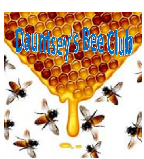
Our new apiary, next to the pond on Mercers' Field, is up and running. Powered by its own solar panels, the facility provides two hives, a covered observation area and a classroom. The bee club meets every Monday afternoon and already has a keen band of young beekeepers.